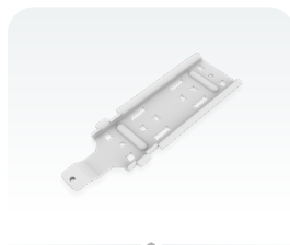
Outdoor case bracket