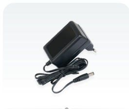
24 V 0.8 A power adapter